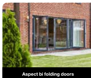
Aspect bi folding doors