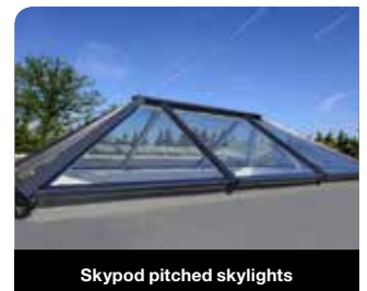
Skypod pitched skylights