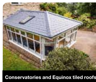
Conservatories and Equinox tiled roofs