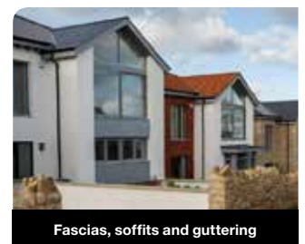
Fascias, soffits and guttering