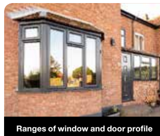
Ranges of window and door profile